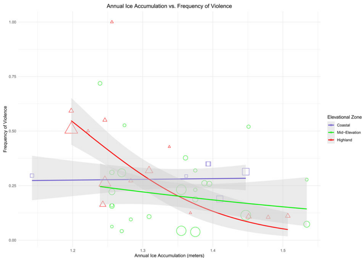
Figure 3. Generalized linear mixed model results, predicting cranial trauma as a function of mean annual precipitation by altitudinal zone. We observe an inverse relationship between interpersonal violence and precipitation within highland contexts, but not mid-elevation or coastal contexts. The frequency of violence ranges from 0–1, where 0 = total lack of violence and 1 = evidence of violence throughout the entirety of the skeletal assemblage. Dots indicate archaeological sites, with dot size indicating sample size, which ranges from 5–277. Lines represent relationship between annual ice accumulation the frequency of cranial trauma, with gray ribbons represent standard error ranges, and dot sizes represent sample size per archaeological site.

Perhaps the most likely explanation for the relationship between violence and precipitation in the highlands is conspecific competition over limited resources during times of resource scarcity. Other archaeological studies have reported a similar correlation between climatological conditions and interpersonal violence in the Andean highlands (Torres-Rouff, 2020; McCool et al.,